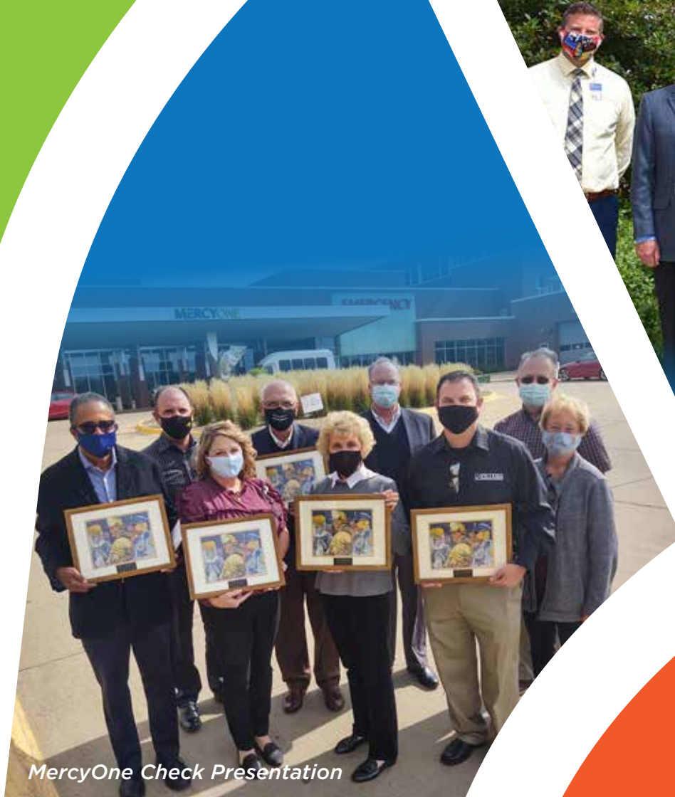
MercyOne Check Presentation