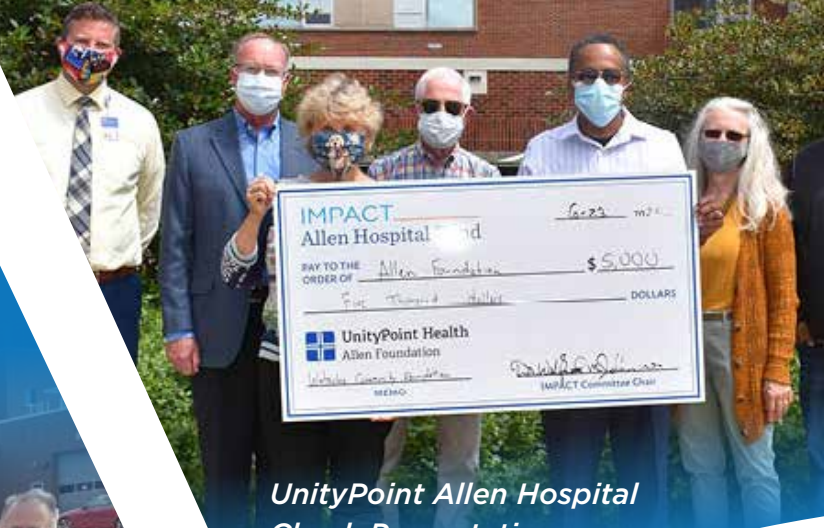
UnityPoint Allen Hospital Check Presentation