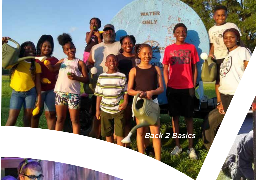
Back 2 Basics