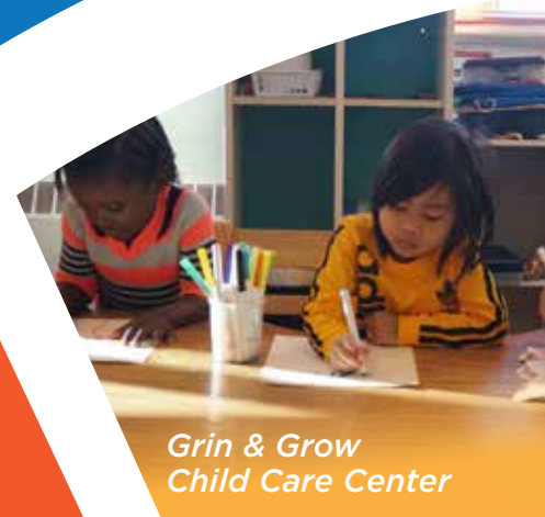
Grin & Grow Child Care Center