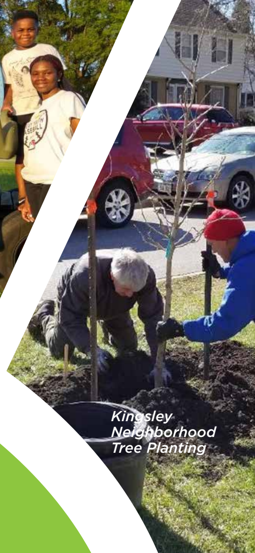
Kingsley Neighborhood Tree Planting

Your year end gift makes it possible for the Foundation to continue to support the organizations and the people that make Iowa great. Our Board is also committed to the immediate needs of our community and has directed funds to benefit: