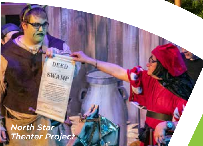
North Star Theater Project